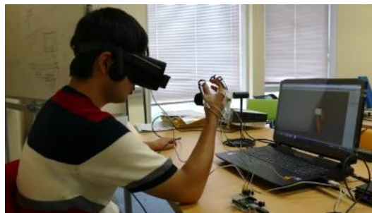
Fig. 1. Whole Picture of the fabricated System

Fig.1 shows a whole picture of the fabricated system consisting of HMD, a hand motion sensor and a force-displaying glove. Users see a virtual object and re-rendered his or her own hand via HMD they wear. The position and posture of their hand are captured by the sensor with stereo IR camera (Leap Motion by Leap Motion, Inc.). The users put on the glove implemented with piano wires that constrain finger movements, making users feel reaction force of the virtual object (Fig.2). Note that no active electrical components are embedded in the wire and hence the actual reaction force is uncontrollable. The displayed object deforms as the users move their fingers. As stated above, the displayed flexions of users' fingers are processed and the object deformation is directly affected accordingly (Fig.3). A vibrator is installed on the glove for displaying clicking vibrations representing virtual creaking of the deformed objects.